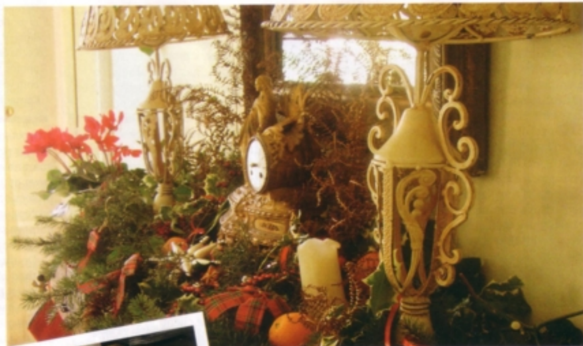
Pictures of cosy Christmas scenes and snowy scapes, such as those used by La Castel's owners, will help pull in guests over the festive period

All over France, shoes are placed in front of the fireplace on Christmas Eve so Père Noël can fill them with gifts. Decorations in streets and homes are chic, with classic red bows and white lights much in evidence. In general, the emphasis is greatly on family and the whole affair seems bigger on style than spend when compared with the season in